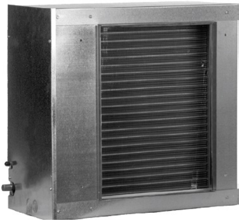
CSCF Horizontal Slab