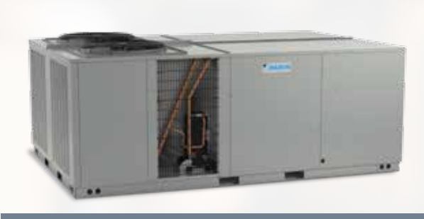
Packaged Unit Models DCC, DCG (25-Tons)