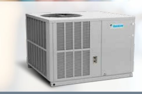
Packaged Unit Models DP13HM, DP13CM, DP13GM