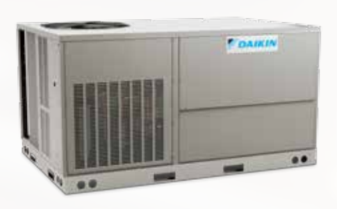
Packaged Unit Models DCC , DCG , DCH (3 - 6 Tons), DT Series (3 - 5 Tons)