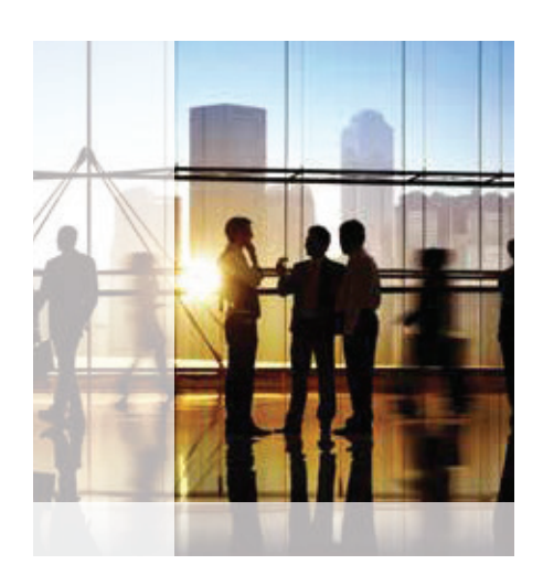
OUTSTANDING LIMITED WARRANTY* PROTECTION