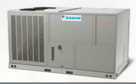
Packaged Unit Models DCC, DCG, DCH (7 ½ - 12 ½ Tons)

Harnessing energy-efficient performance, proven technology, and enhanced Comfort for Life.