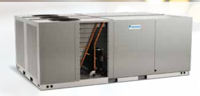
Packaged Unit Models DCC, DCG (15 & 20 Tons)