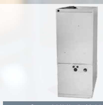
Commercial Air Handler Models DAR , DAT