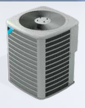
Split System Air Conditioner Models DX13 , DX11 Split System Heat Pump Models DZ13 , DZ11