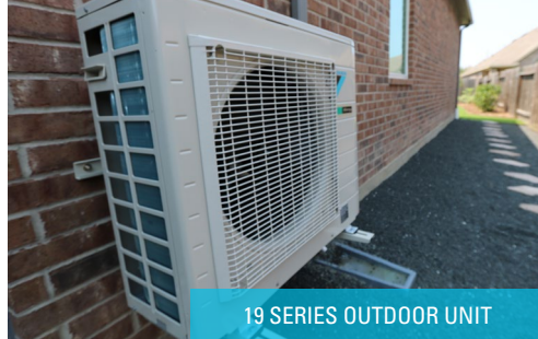
19 SERIES OUTDOOR UNIT