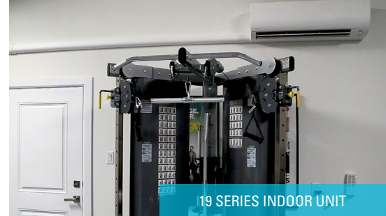
19 SERIES INDOOR UNIT

replacement you would be able to choose your own, but it shouldn't keep you from telling your builder what you want," Andrea mentions.